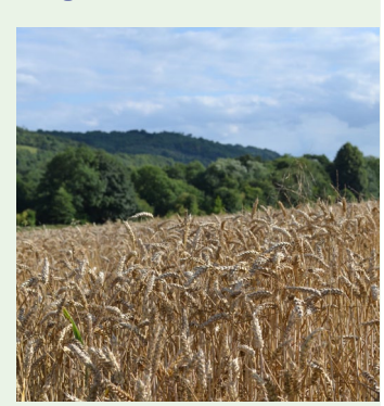
Cereal field by Lull'stone Castle (point 7)